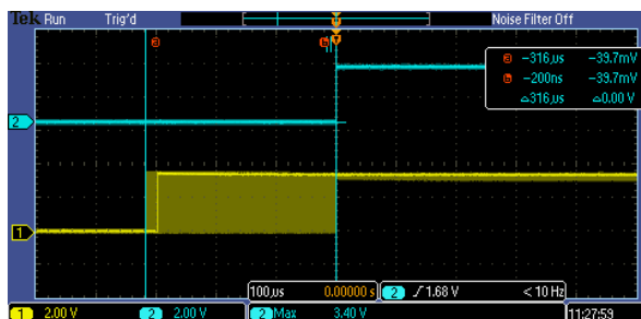
Figure 3, CM1608F0-AERO-GMC, clock drift

Figure 3 shows that the clock drift for the CM1608F0 GMC with OCXO as oscillator from OnTime Networks after GPS lock is lost, is less than 320us over a time period of 60 minutes when the temperature is cycled from: -40°F/-40°C to 203°F/95°C. This means clock hold-over capability better than 0.1ppm.